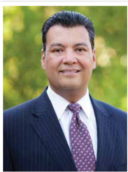
CA SECRETARY OF STATE ALEX PADILLA